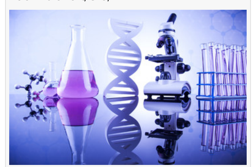
More research is desperately needed for this neglected and devastating cancer

bringing us one important step closer to finding further new treatment options for this devastating cancer."