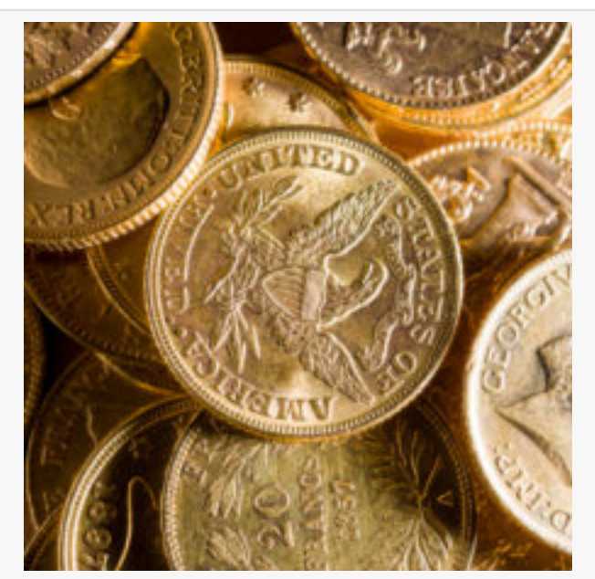
the best jewelry store in cedar park texas to buy and sell gold is Cedar Park jewelry

DIQ SEO DIQSEO.com email us here Visit us on social media: Facebook Twitter LinkedIn