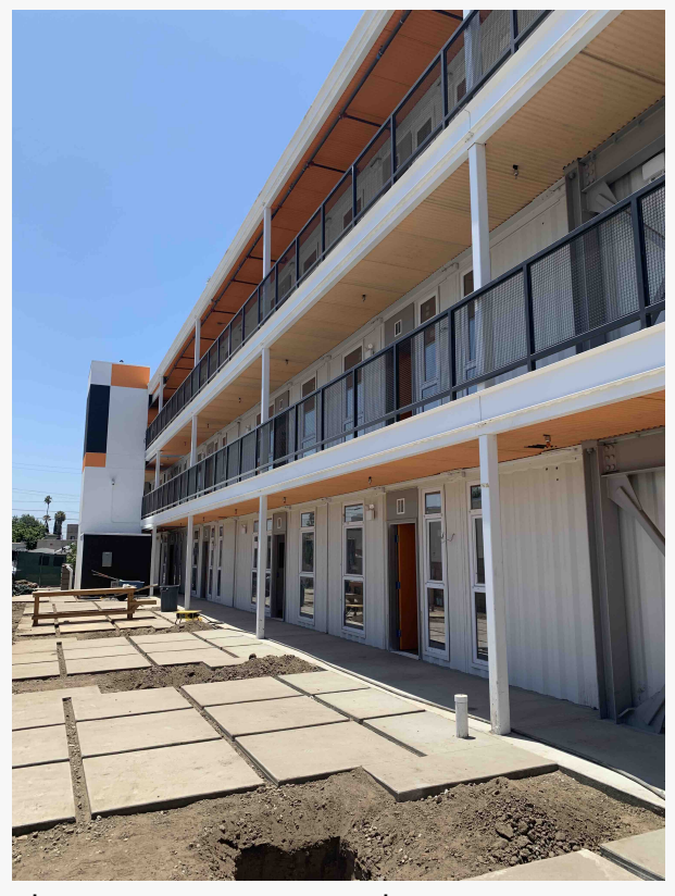
FlyawayHome on 82nd Street

FlyawayHomes' first supportive housing community opened in the fall of 2018, establishing a prototype for an innovative, scalable solution to address housing challenges for chronically homeless individuals and families in Los Angeles. The Steaven