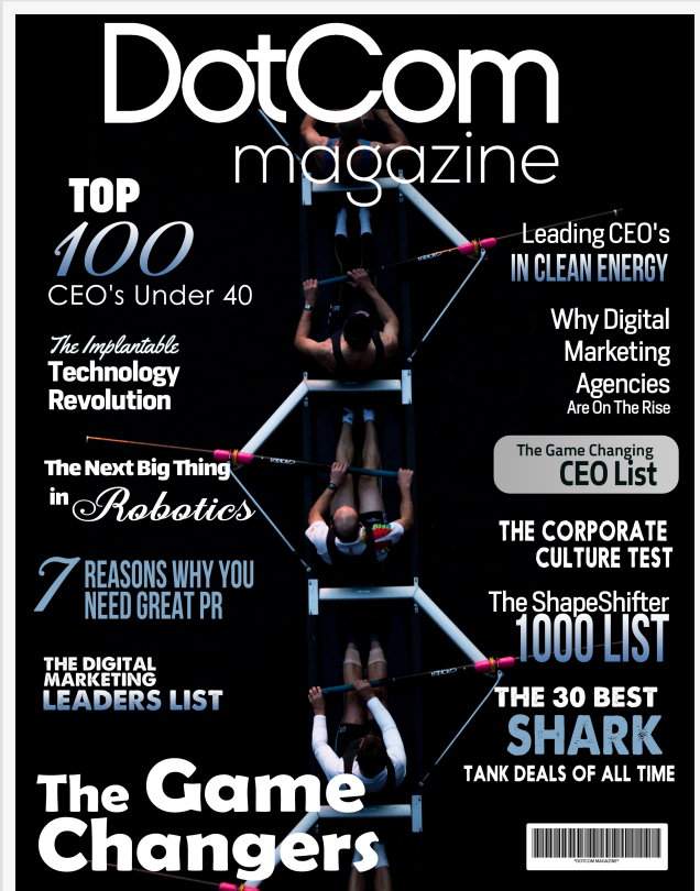
The DotCom Magazine Game Changers Edition