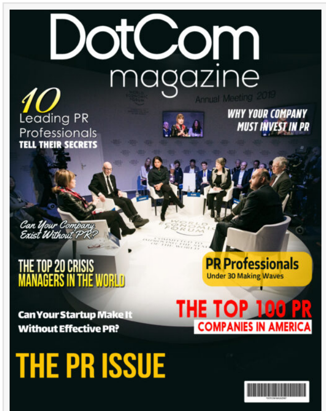
The DotCom Magazine PR Issue