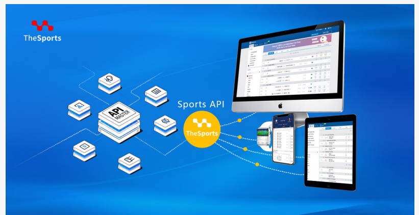
TheSports Feeds API