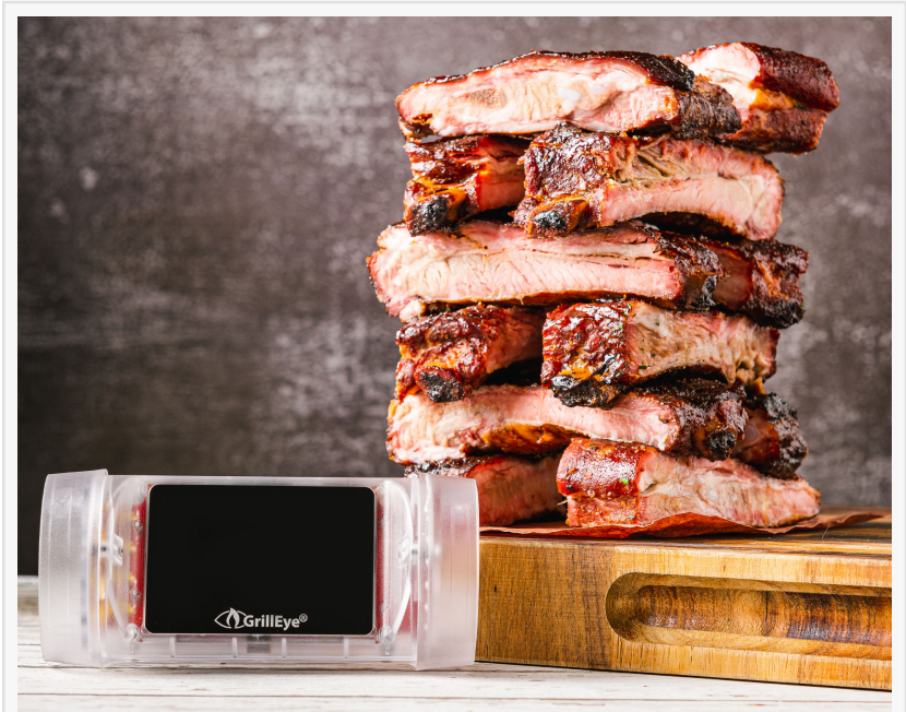
□□□□ GrillEye® Max □□□□□□□□□□□□

email us here Visit us on social media: Facebook LinkedIn