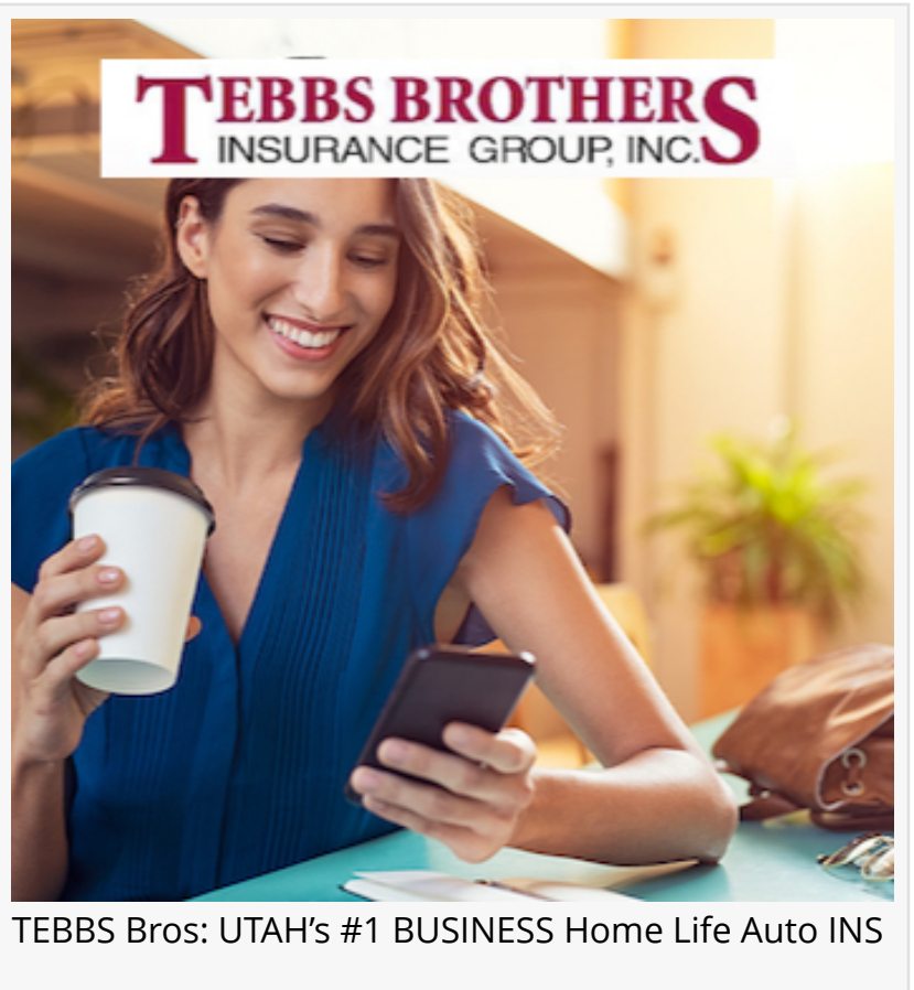
TEBBS Bros: UTAH's #1 BUSINESS Home Life Auto INS