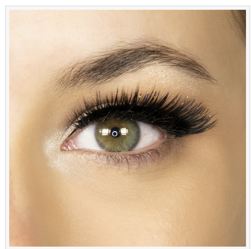
Magnetude® Spirit Stacker, stacked on top of one of our in-line eyelashes

WOODINVILLE, WA, UNITED STATES, July 28, 2021 /EINPresswire.com/ -- Tori Belle Cosmetics launches a line of stackable magnetic eyelashes and magnetic rhinestones called Magnetude® Spirit Line on July 29, 2021. This launch comes just in time for the 2021 Summer Olympic Games and the kick-off to the fall sports season. The new innovative magnetic eyelashes, Spirit Stackers, come in five colors (red, blue, purple, gold, and silver). Pair Spirit Stackers with Spirit Bling; colored, magnetic-backed rhinestones, in ten shades, to add a second color to match your favorite sports team, cause, or event. The new line brings lash-wearing to the next level, helping fans achieve a colorful and playful look.