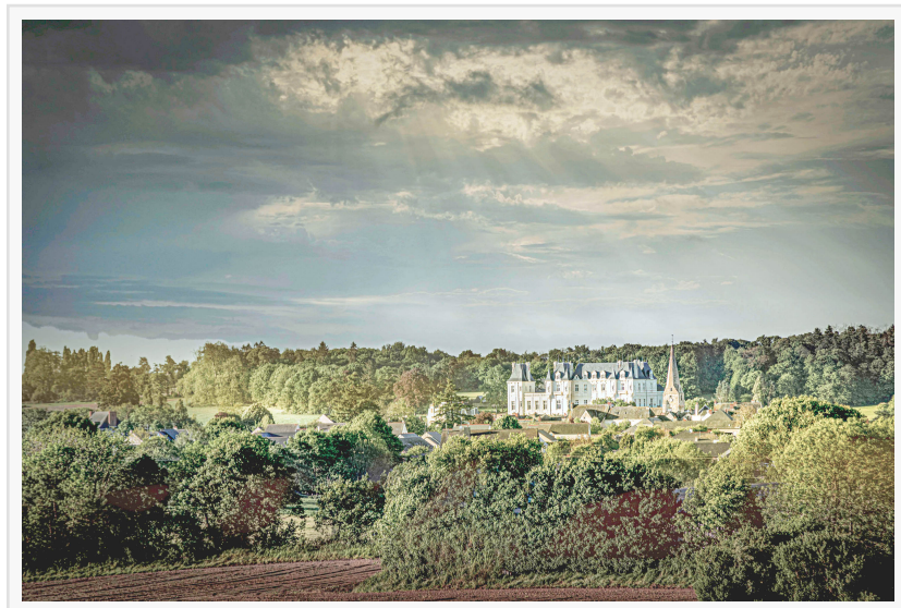
A true gem of neo-Gothic architecture glitters from the heart of the Loire Valley.