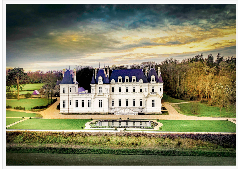
The history of Chateau de Falloux can be traced back to the 18th century with extensive enhancements in the 19th century.

About Concierge Auctions Concierge Auctions is the world's largest luxury real estate auction firm with a state-of-the-art digital marketing, property preview, and bidding platform. The firm matches sellers of one-of-a-kind properties with the most high-net-worth property connoisseurs on the planet. Sellers gain unmatched reach, speed, and certainty. Buyers get incredible deals.