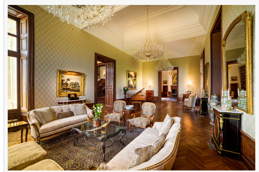
Its recent renovation, which was completed in 2018, has breathed new life and modernity into each of its rooms, from herringbone parquet floors to soaring cathedral ceilings.

Agents earn their commission in 30 days. Since its inception in 2008, Concierge Auctions has generated billions of dollars in sales, broken world records for the highest-priced homes ever achieved at auction, and grown its activity in 44 U.S. states/territories and 30 countries. The firm owns the most comprehensive and intelligent database of high-net-worth real estate buyers and sellers in the industry, and has contributed more than 300 homes to-date as part of its Key for Key<sup>®</sup> giving program in partnership with Giveback Homes™, which guarantees that for every property the company sells, a new home is funded for a family in need. For more information visit ConciergeAuctions.com.