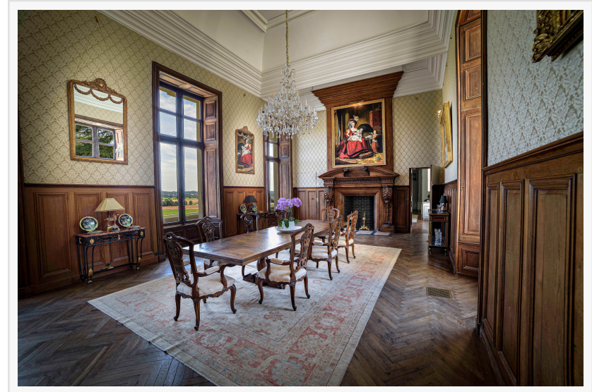
Sumptuous chandeliers and immaculate oak paneling throughout provide a warm and cohesive design that calls you to linger in each new room.