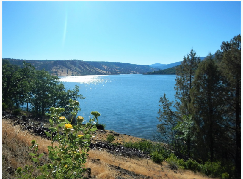
Copco Lake that is formed by the Copco 1 dam on the Klamath River has been the critical habitat for an amazing variety of species of flora and fauna, including numerous endangered and threatened species.

Here, as in S. California Edison , the record indicates, and FERC has acknowledged, environmental impacts as a result of this project arising from decommissioning the Lower Klamath Project dams.