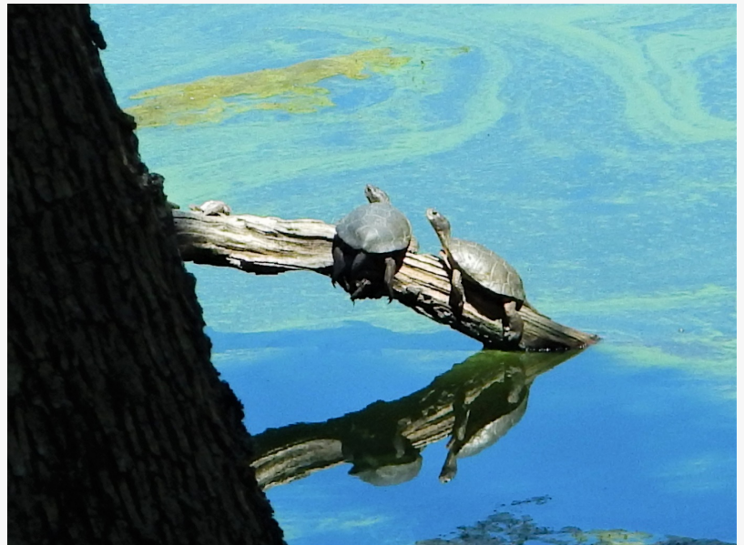
A pair of threatened Western Pond Turtles at Copco Lake. Just one of many threatened and endangered species of flora and fauna.