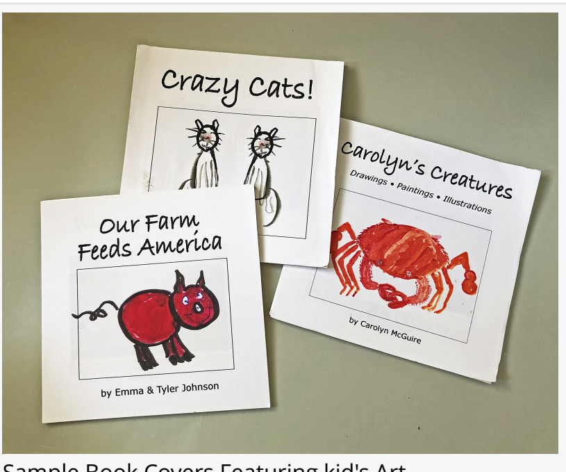
Sample Book Covers Featuring kid's Art

McGuire says groups like siblings or scouts can join together for a book to promote a worthy cause or help