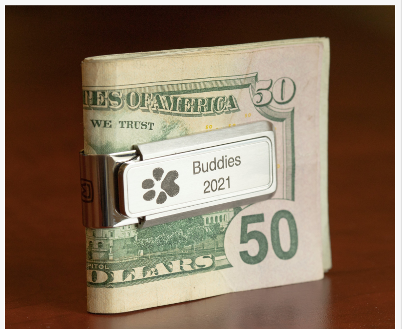
Thumbies' Stainless-Steel Money Clip with Paw Print Personalization