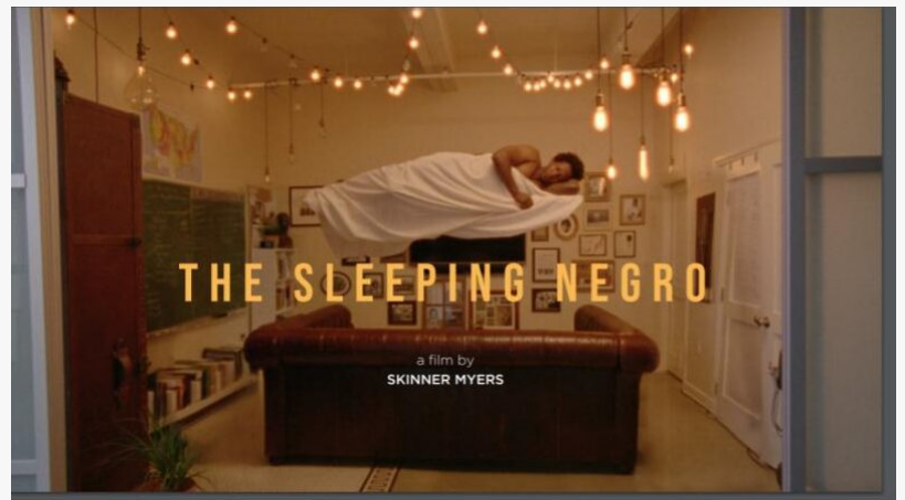
The Sleeping Negro

NEW YORK, NY, UNITED STATES, July 26, 2021 /EINPresswire.com/ -- THE SLEEPING NEGRO had its world premiere at Slamdance 2021. It is currently screening in festivals in the USA and around the world. It will start its US theatrical run on Dec. 3 at Cinema Village in New York and at the Glendale in LA, before getting a digital and home-video release.