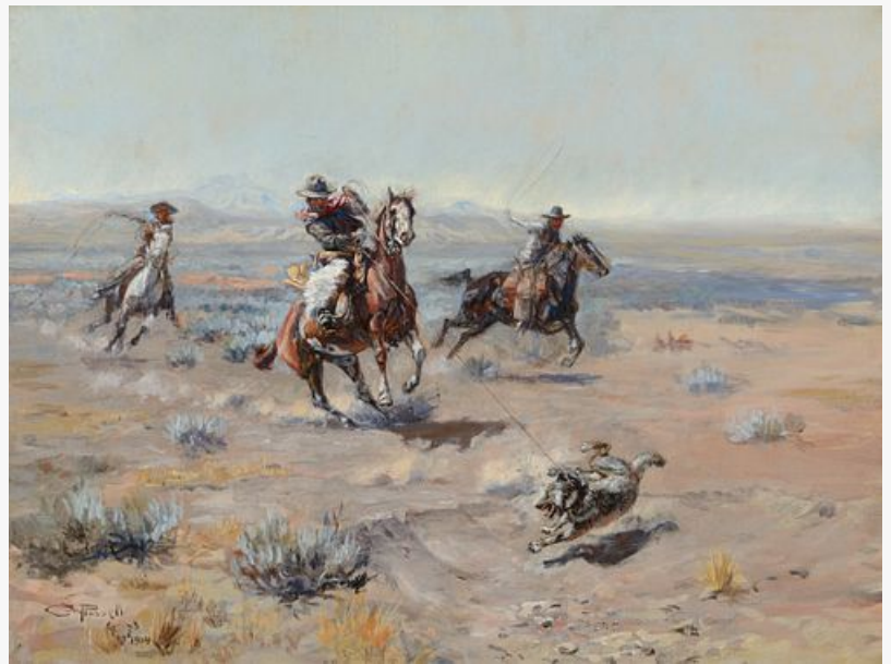
Charles M. Russell (1864–1926) — Roping a Wolf (1904)

The prolific American artist captured the American West with his paintbrush, often capturing scenes of cowboys and Native Americans. Russell completed the available painting shortly after returning from a trip to New York City. It marks the beginning of his mature artistic period. The piece depicts three professional 'wolfers' capturing a wild wolf. Hazy mountains are visible in the background as the lead rider snags the animal mid-air.