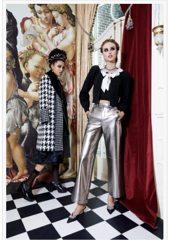
alice + olivia Fall 2021 Collection