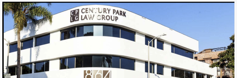
Century Park Law Group Building