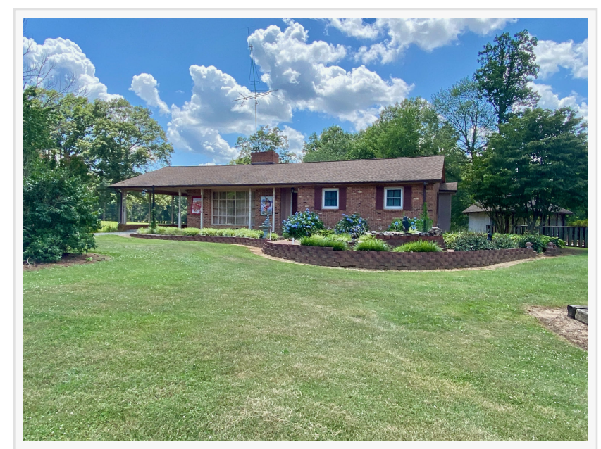
15598 Mountain Track Road, Orange, VA 22960

Nicholls Auction Marketing Group, Inc., is a professional accelerated marketing firm specializing in the promotion and sale of real estate via the auction method of marketing. Headquartered in Fredericksburg, VA, NAMG has been serving the needs of the Mid-Atlantic region since 1968. The Nicholls team comprises world and state champion