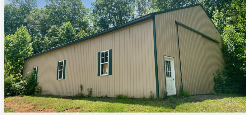
8166 Burr Hill Road, Rhoadesville, VA 22542

Wednesday, August 4 at 2:30 PM – 8166 Burr Hill Road, Rhoadesville, VA 22542 3 BR/2 BA ranch style home on 4.38 +/- acres -- Detached 2 bay garage -- Detached 45'x68' shop building -- Great opportunity for a home based business