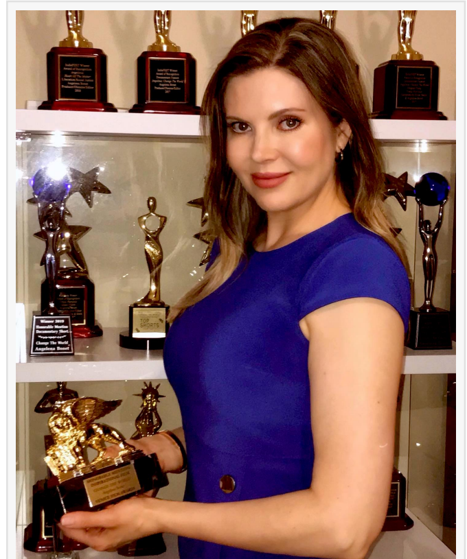
Best Inspirational Film