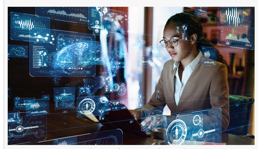
ImpactData is Bridging the Digital Divide

and universities to gain a foothold in emerging technology fields. A recent Pew study reports that only 7 percent of Black undergraduates are enrolled in degree seeking STEM fields, but these new data architects are challenging the status quo by developing a more career-ready workforce of students and up-skilled local residents.