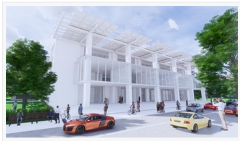
ImpactData Dream Center Concept

The flagship Dream Center will launch on a soon to be announced HBCU campus in early 2022, with the company's sights set on a collection of attractive Edge markets, including Atlanta, Dallas, Houston, Nashville, St. Louis, Birmingham and Charlotte. The pilot Dream Center will create a framework for subsequent colleges