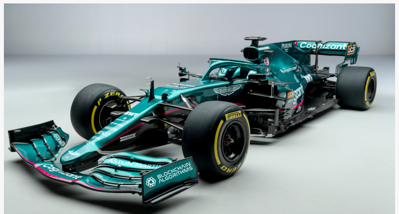
Blockchain Algorithms Sponsorship

An image released by Blockchain Algorithms shows prominent branding on the sidepod of a green Formula One car, although the team's definitive livery will not be unveiled until next March at a launch event at Aston Martin's HQ in Gaydon.