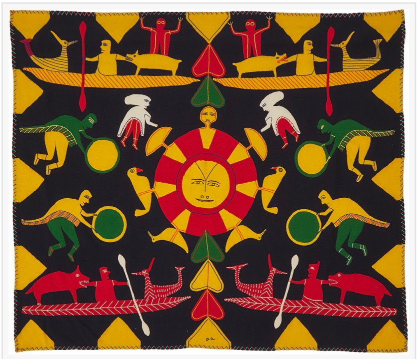
Jessie Oonark, 'UNTITLED', Stroud, Thread, Embroidery Floss; 47 1/4 in x 53 3/4 in; 120 cm x 136 cm, signed in syllabics, Estimate: $80,000–120,000