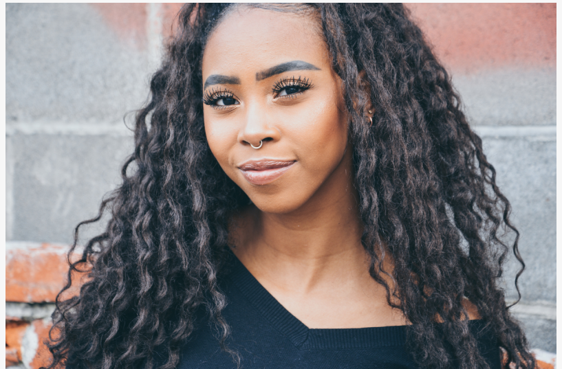
Rahab's Hope of Ohio