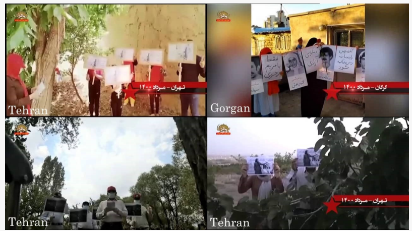
(PMOI / MEK Iran) and (NCRI): Tehran and Gorgan – Activities of Resistance Units and MEK supporters in commemoration of the victims of the 1988 massacre – July 29, 2021.