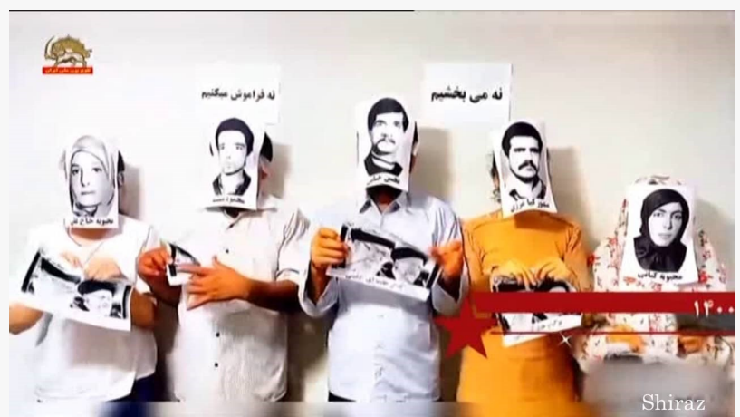
(PMOI / MEK Iran) and (NCRI): Shiraz – Activities of Resistance Units and MEK supporters in commemoration of the victims of the 1988 massacre – July 29, 2021

Local communities welcomed the activities with enthusiasm.