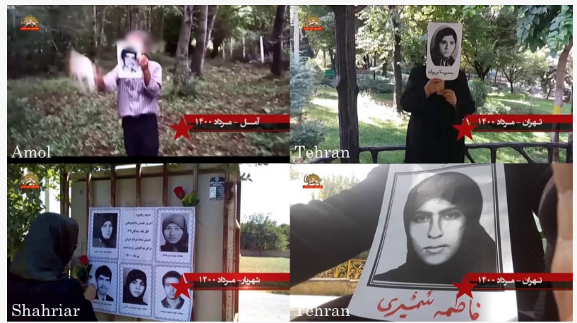
(PMOI / MEK Iran) and (NCRI): Tehran, Amol, and Shahriar – Activities of Resistance Units and MEK supporters in commemoration of the victims of the 1988 massacre – July 29, 2021.