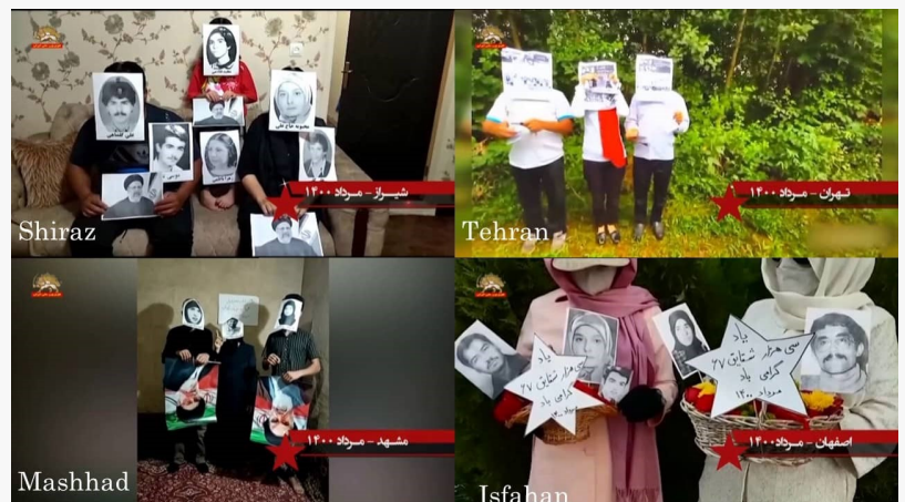
(PMOI / MEK Iran) and (NCRI): Shiraz, Mashhad, Tehran, and Isfahan– Activities of Resistance Units and MEK supporters in commemoration of the victims of the 1988 massacre – July 29, 2021.