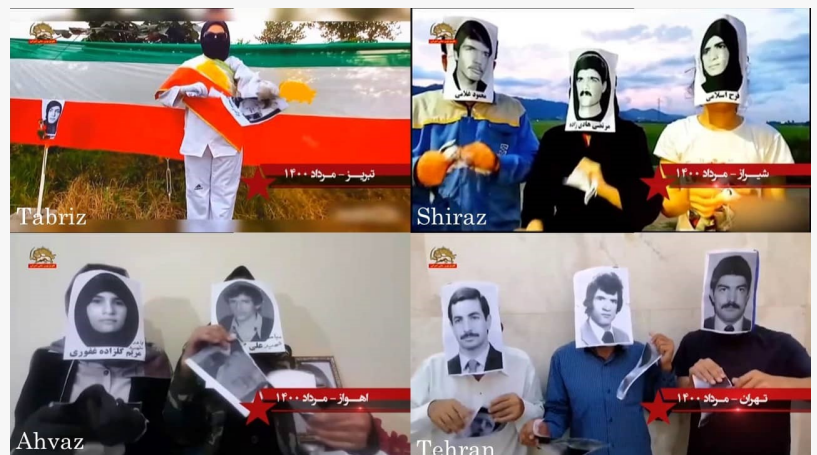
(PMOI / MEK Iran) and (NCRI): Tehran, Ahvaz, and Tabriz – Activities of Resistance Units and MEK supporters in commemoration of the victims of the 1988 massacre – July 29, 2021.