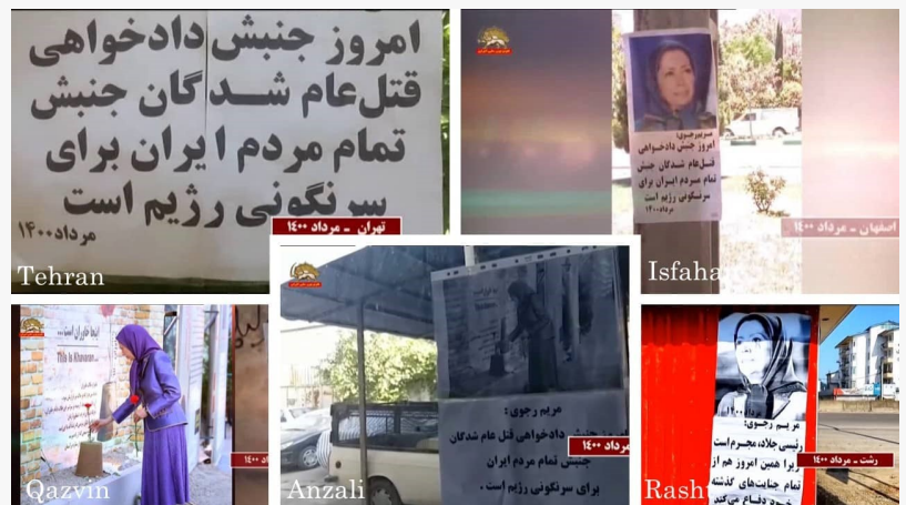
(PMOI / MEK Iran) and (NCRI): Tehran, Isfahan, Rasht, Qazvin, and Anzali – Activities of Resistance Units and MEK supporters in commemoration of the victims of the 1988 massacre – July 29.