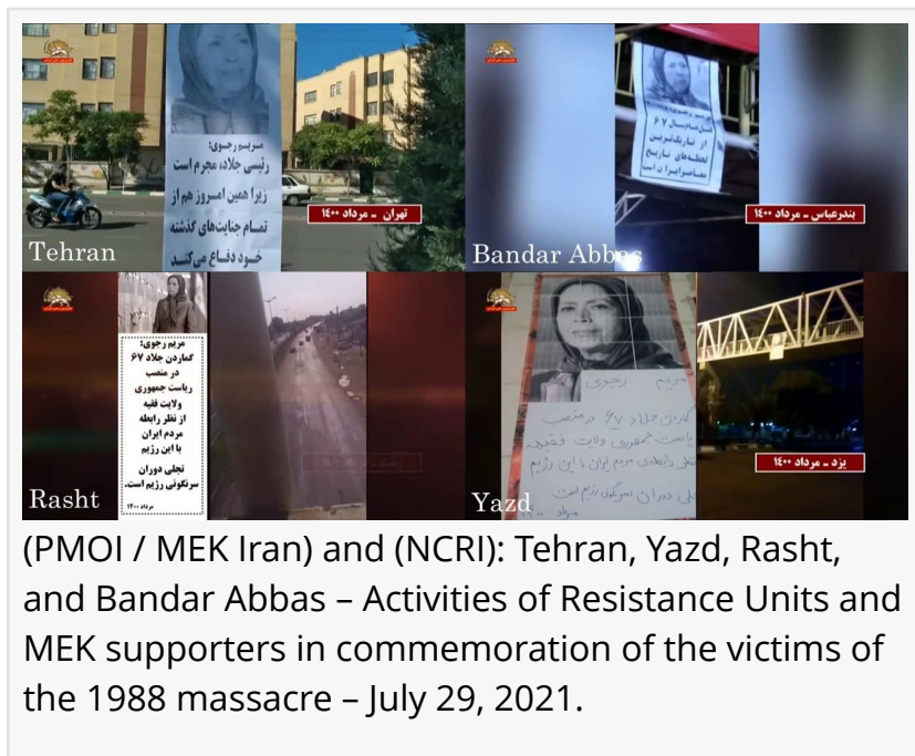
(PMOI / MEK Iran) and (NCRI): Tehran, Yazd, Rasht, and Bandar Abbas – Activities of Resistance Units and MEK supporters in commemoration of the victims of the 1988 massacre – July 29, 2021.

This press release can be viewed online at: https://www.einpresswire.com/article/547649716