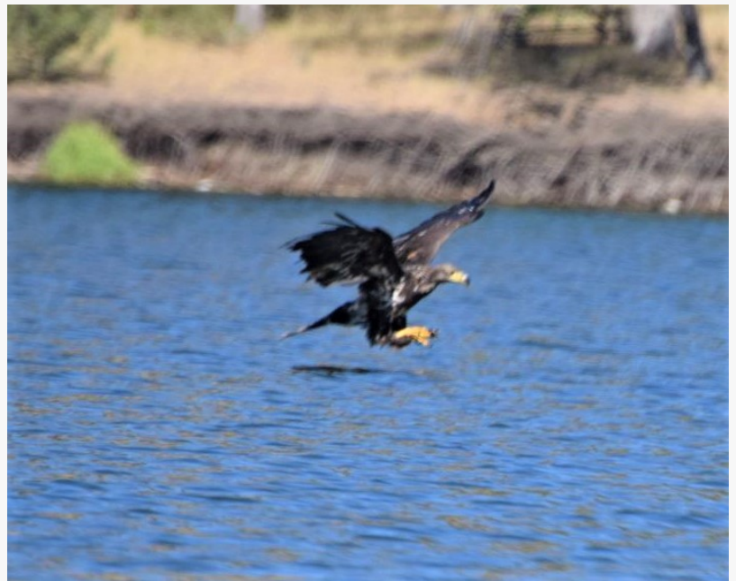
A Golden Eagle is seen fishing on Copco Lake. Both Bald and Golden Eagles, being large raptors require areas of open-water to catch the fish they eat.