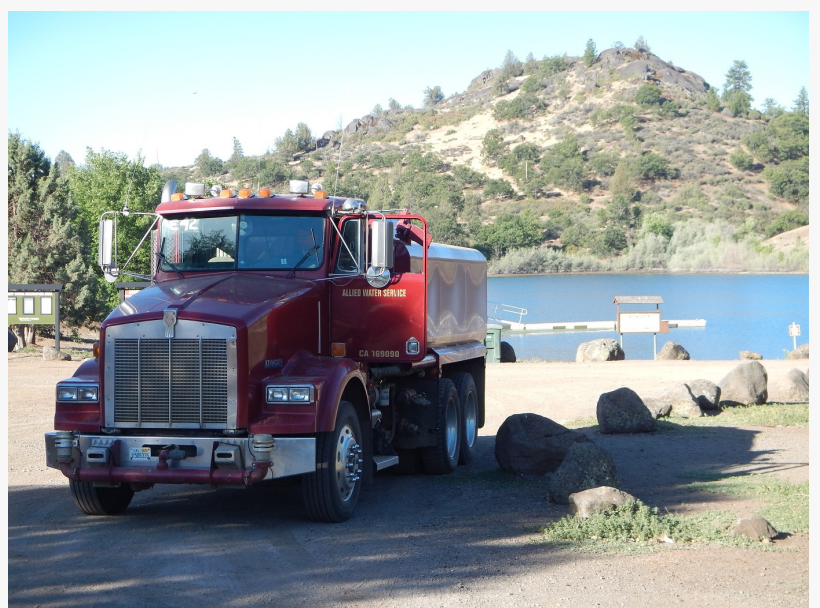
'Beneficial Use': CAL-FIRE drafted over one-million gallons of water from Iron Gate Lake to battle the 38,000 acre Klamathon Wildfire that was stopped before it incinerated the Cascade-Siskiyou National Monument and Ashland OR: Photo by; William E. Simpso

No water to drink, shower or flush toilets!