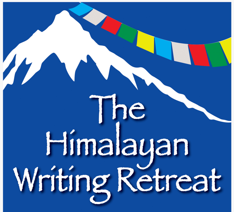
Himalayan Writing Retreat Logo

"When other countries can have bestseller lists like the New York Times bestseller list in the USA, why not us? India has a sizeable number of readers always on the lookout for new books that match their tastes. As teachers of writing, we're often asked, 'What are