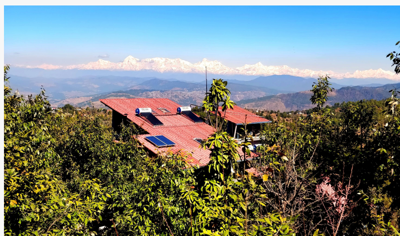
The Himalayan Writing Retreat, with India's tallest peaks in the distance

includes data from physical bookstores across the country as well as from online channels like Amazon and Flipkart. It will cover approximately 60% of all print book sales in India, making it the most comprehensive, credible bestseller list in the country.