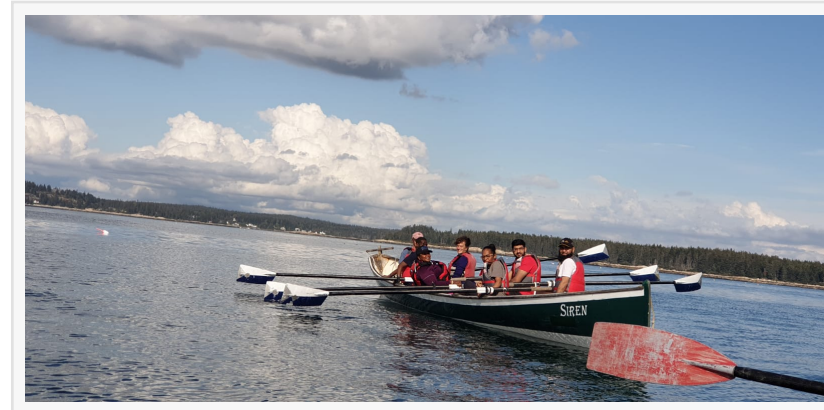
UPG Sustainability Leaders completing an activity on water together

6 of the members of the delegation were chosen via a public engagement BETA campaign with over 9,500 voters participating from across the world. The winners were announced at the announcement event. Those chosen