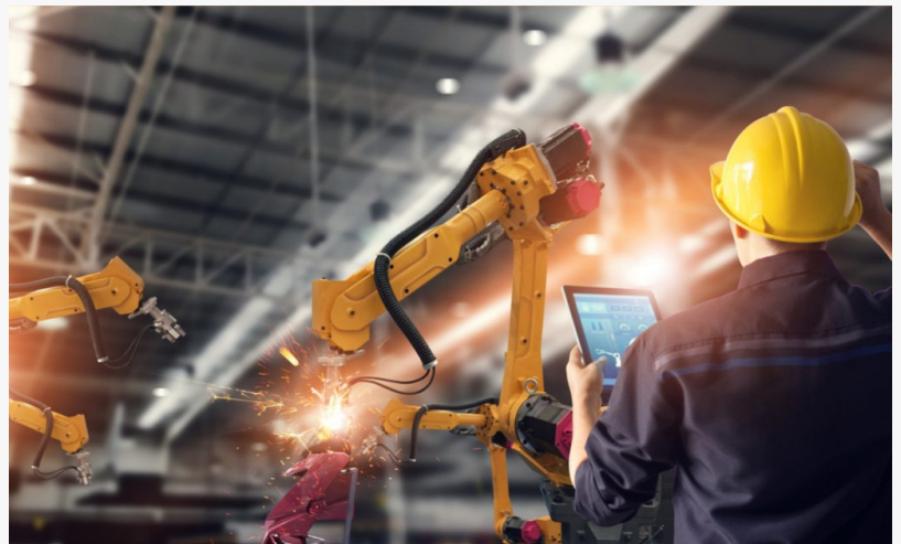
Ai Manufacturing Analytics to improve efficiency and yields