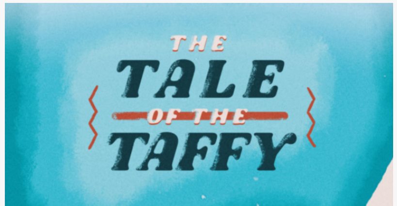
The Tale of the Salt Water Taffy

Saltwater taffy is a variety of soft taffy that was produced in the 19th century in Atlantic City, New Jersey which started in the late 19th century.