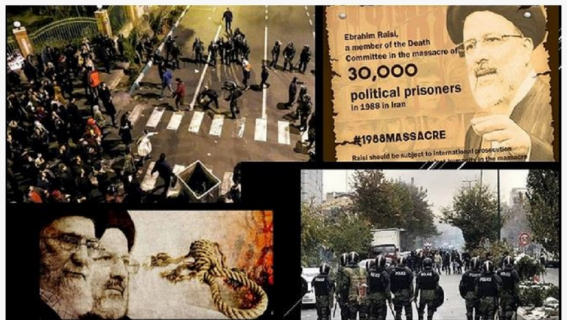
(PMOI / MEK Iran) and (NCRI): Iranian regime's supreme leader Ali Khamenei and Ebrahim Raisi.