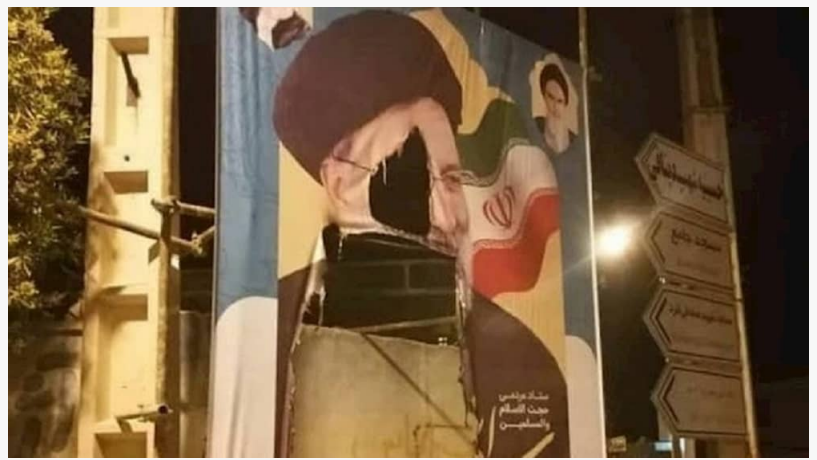
(PMOI / MEK Iran) and (NCRI): Iranian people are ripping posters of Ebrahim Raisi, the leading candidate for the regime's sham presidential election.

As Mrs. Maryam Rajavi , the President-elect of the National Council of Resistance of Iran (NCRI) , said in an address to the Free Iran World Summit on July 10, "Only the regime's fear of the uprisings and the supreme leader's political demise can explain Raisi's taking office."