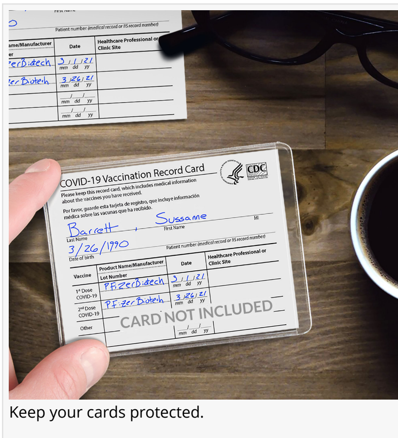
Keep your cards protected.

Vaccinated individuals might want to take a few additional steps to safeguard their records.