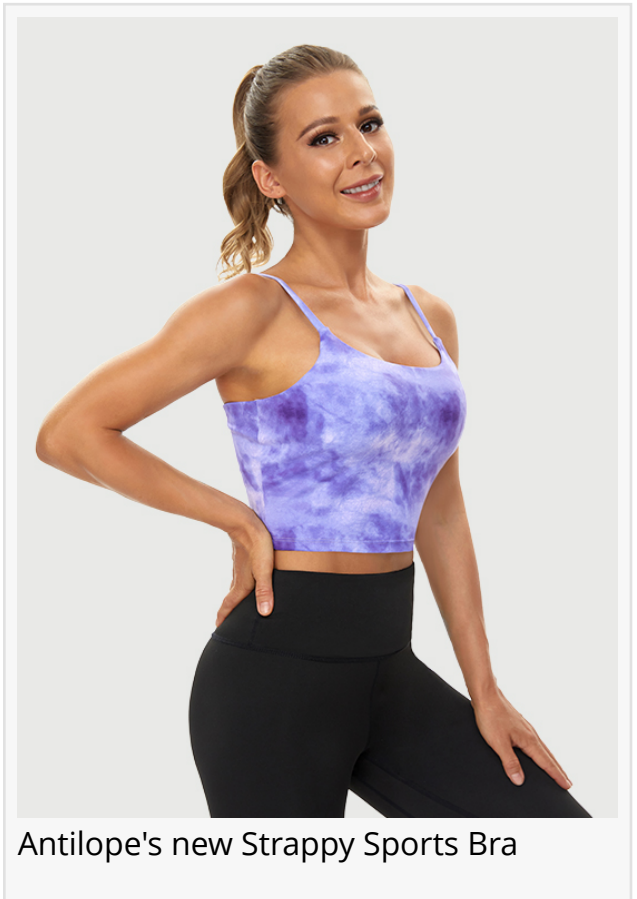
Antilope's new Strappy Sports Bra

3 - The Antilope Strappy Sports Bra is suitable for any taste and looks since it comes in 11 color options.