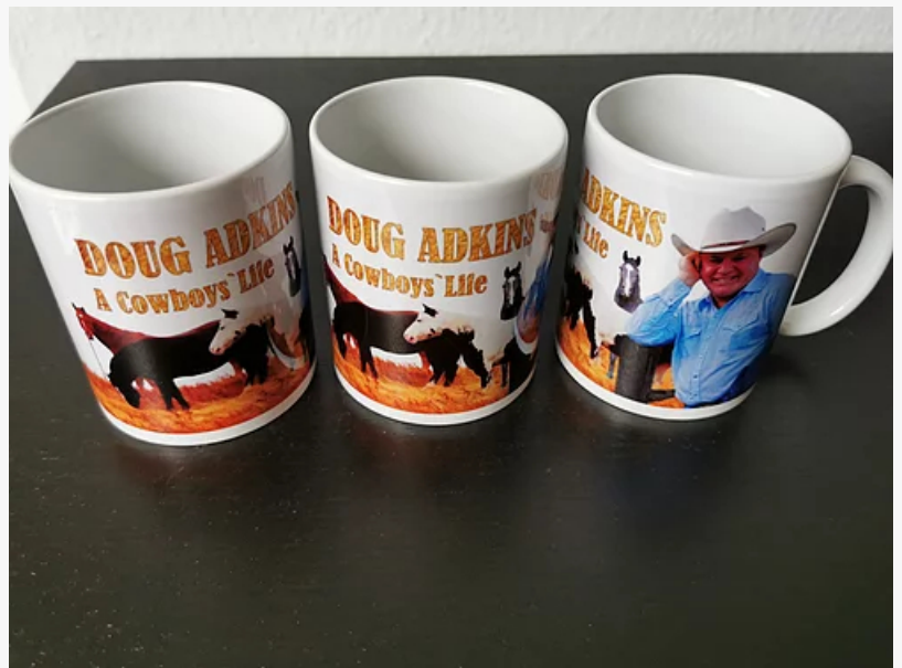
A Cowboys' Life Coffee Cup