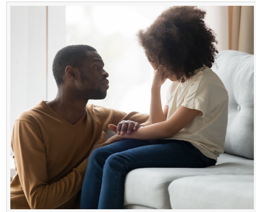
Child Collateral Damage

It is imperative that a pivot takes place to turn away from mass incarceration and long sentences in deplorable dilapidated facilities with disgusting food, mold, mice and less than stellar medical services and take a laser beam approach to the original design. That beginning day one of incarceration preparing them for reentry to include a