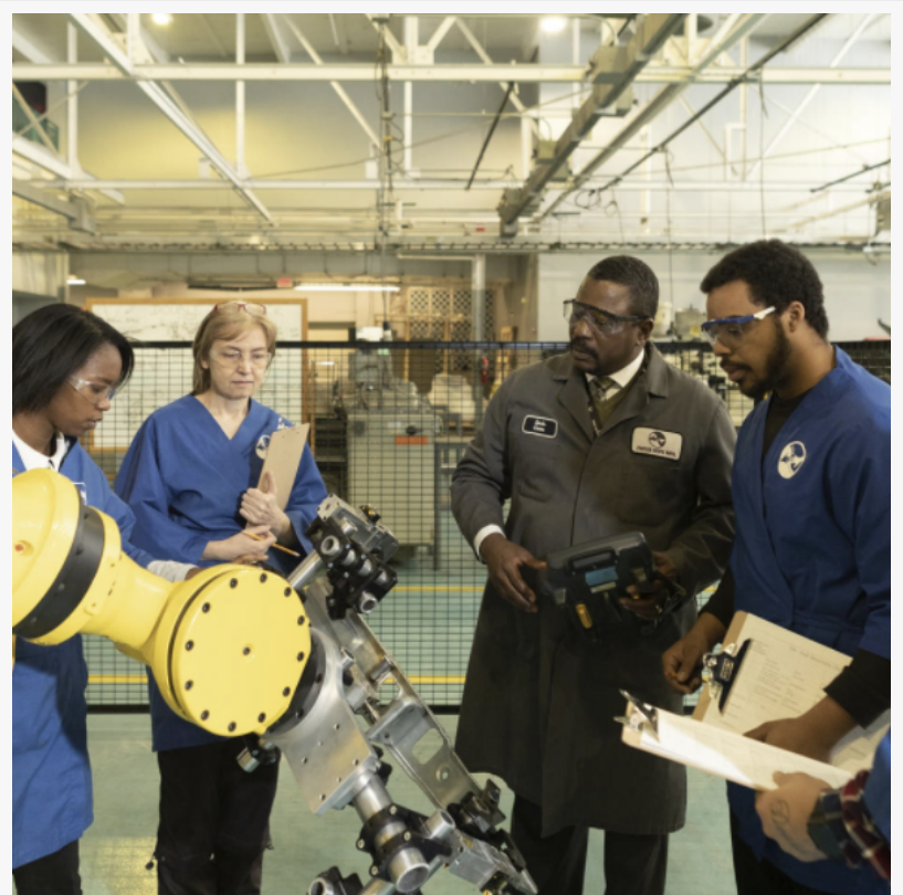
Industrial Manufacturing class

The Industrial Manufacturing Training Pathways program provides training for skilled manufacturing positions. This 15-week, 300-hour course trains students in Manufacturing Readiness, Hi-Lo, CNC Operations, Industrial Robotics and Welding. The Information