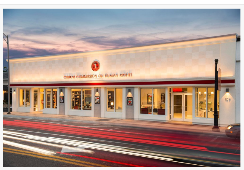
The headquarters for CCHR Florida are located in downtown Clearwater.

CLEARWATER, FLORIDA, UNITED STATES, August 3, 2021 /EINPresswire.com/ -- Commonly known as the <u>Baker Act</u>, Florida's mental health law, allows for individuals of all ages to be taken into custody for an involuntary psychiatric examination. However, this law is often misunderstood and misused. With changes made during the 2021 legislative session on the procedure for