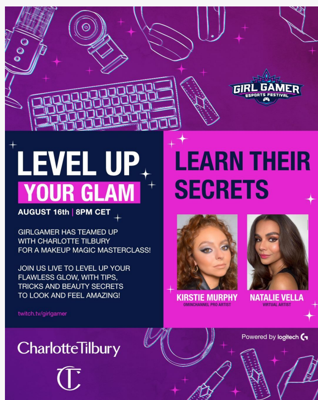
Level Up Your Glam Masterclass