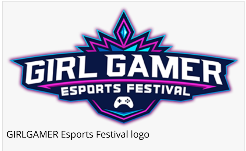
GIRLGAMER Esports Festival logo

The collaboration marks the cosmetics brand's first move into Gaming and Esports