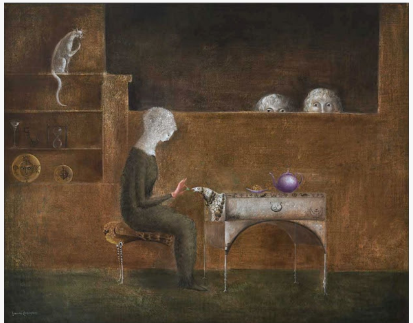
Leonora Carrington, Dándole de comer a una mesa , Sold by Morton Subastas for MXN$16,200,000 ($815,910) on Bidsquare

"I'm excited to join Bidsquare's board. Morton Subastas has been using Bidsquare's platform