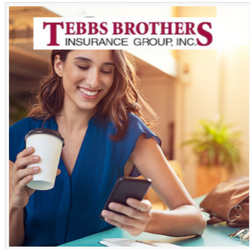
TEBBS Bros: UTAH's #1 BUSINESS Home Life Auto INS

policy to fit your needs - from RVs and boats to ATVs, Tebbs Brothers Insurance Group, Inc. can ensure the safety of both you and your vehicle. TBIG insurance options provide you with the same service and rich features you can expect – from comprehensive and collision coverage to personal injury protection and towing costs. The thrill of adventure – it is what owning a recreational vehicle is all about. Whatever your interest, be it cruising on your motorcycle or exploring the road less traveled on your ATV, Tebbs Brothers Insurance Group, Inc. offers advanced coverage options to meet the insurance needs of the adventurer in everyone. TBIG offers a variety of Recreational Vehicle Insurance packages, such as: