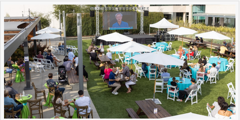
Orange County, CA Watch Party for Miracle of Mobility Live

In addition to the virtual program, the organization supported local watch party events, including gatherings in Orange County, California; Prescott, Arizona; and other places around the