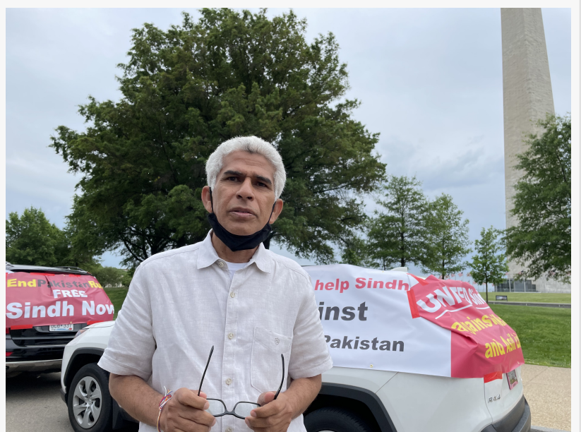
Rally for Sindhis in Washington DC

Media Contact: 1-202-378-0333 or sindhifoundation@gmail.com