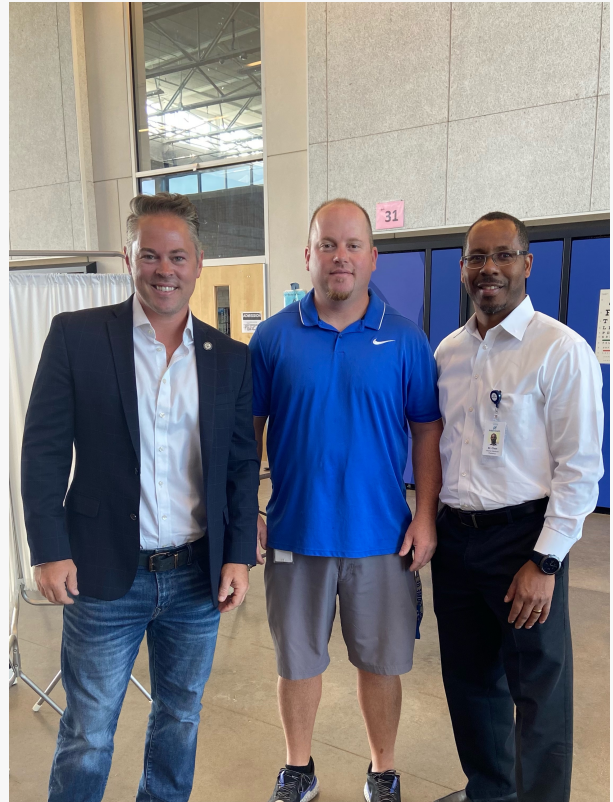
Noble Health Foundation Provides Free Physicals to Student-Athletes