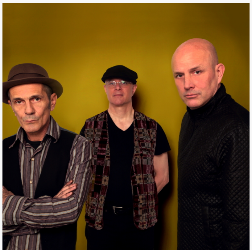
Zero Times Everything