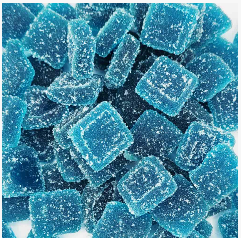
Sir Hemp Co. Delta 8 Gummies

Florida's Premier Hemp Extracts Manufacturer Sir Hemp Co. Introduces line extension with its Delta 8 gummies . These D8 edibles will be potent and manufactured to the quality standards customers have come to expect from a reputable company like Sir Hemp Co.