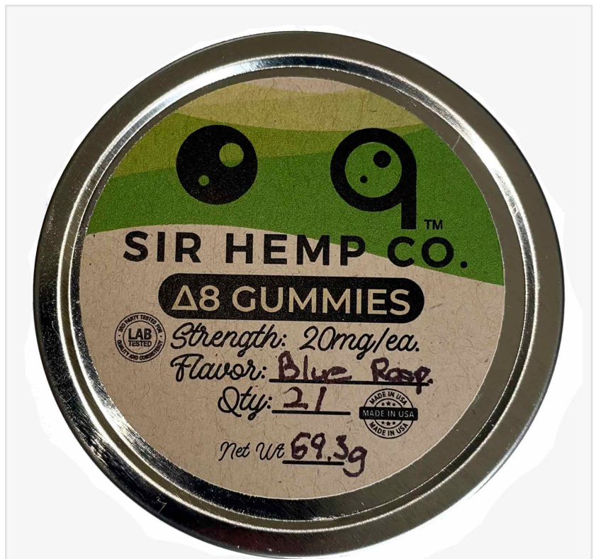
Delta 8 Gummies

It is worth noting that they will only ship Delta 8 THC gummies to the States which have not