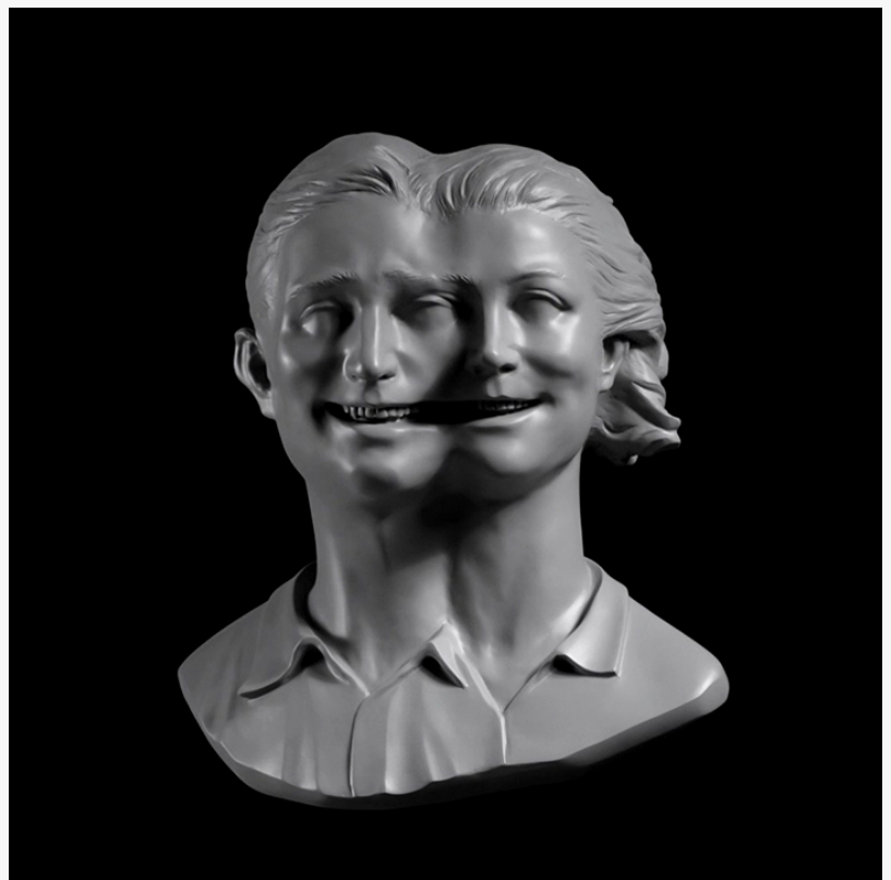
Two People by Yongju Kwon

T&C Foundation (established in 2017) curated the apov ("Another Point of View") exhibition, "The World We Made." The foundation conducts scholarship, education, welfare, academic research and support projects to resolve educational inequality and foster empathetic talent. Under the "apov project," the T&C Foundation plans and operates exhibitions,