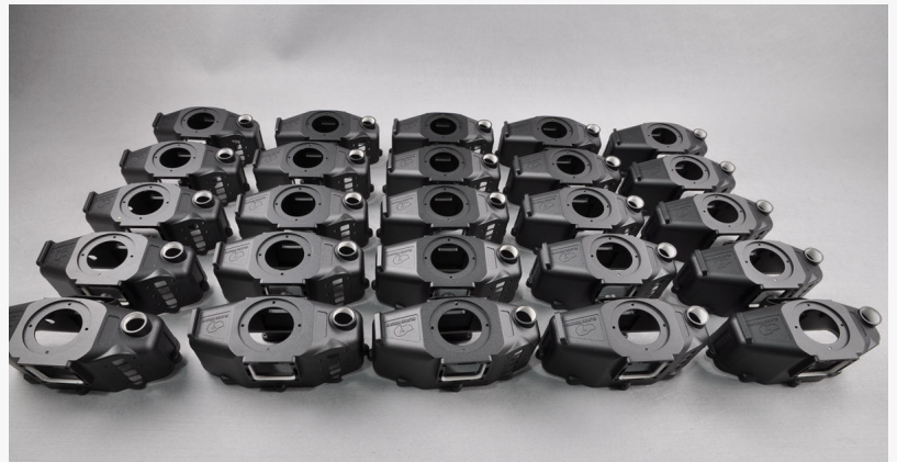
low volume custom cnc machining-3

With over 20 years of experience in this business, WayKen prides itself as an expert in custom machining and is very reliable in producing high-quality and precise parts. Most clients are leaning towards custom low-volume CNC machining because it allows the parts to be built faster and get to the market quickly.