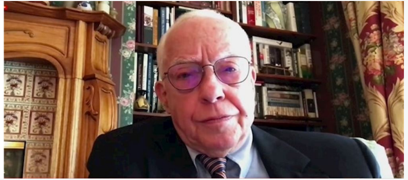
(PMOI / MEK Iran) and (NCRI): Michael Mukasey, 81st U.S. Attorney General. The overwhelming majority of those tortured and executed in the 1988 massacre and targets of this fatwa was principally members of the MEK.

Perhaps the most convincing evidence of this is a very selection today and it would be insulation today, or Raisi as president. What shows is the current supreme leader Ali Khamenei and those who follow his orders had no regard, whatever for appearances. They put in place someone they believe can be relied on to use any measures, however, brutal to keep the regime in power.