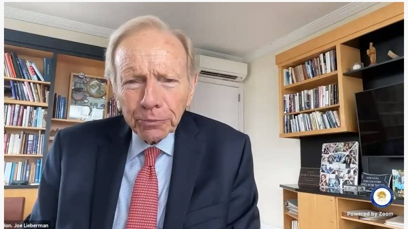
(PMOI / MEK Iran) and (NCRI): Senator Joe Lieberman, During its 42 years in power, this evil and extreme regime in Tehran has spent enormous amounts of the treasure that belongs to the Iranian people supporting foreign terrorists, in building a nuclear weapons program.