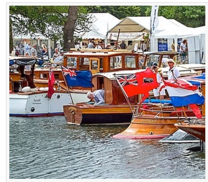
TRAD BOAT FESTIVAL Unique to the UK

evoking the nostalgia of boating from a bygone era.