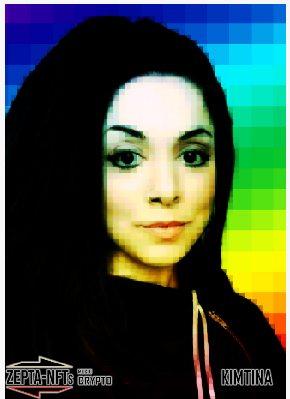
Kimtina NFT2 by Christo

This press release can be viewed online at: https://www.einpresswire.com/article/548230626