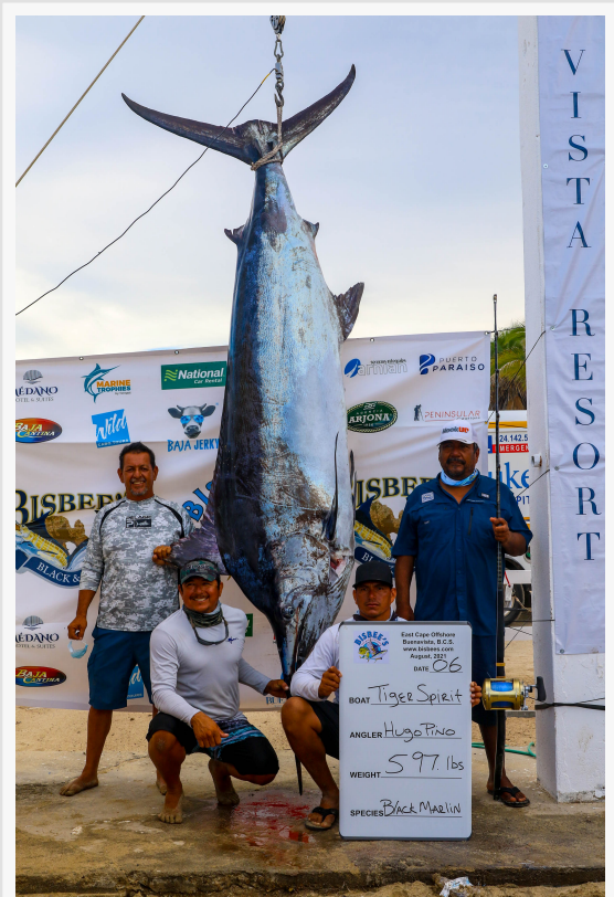
1st Place Overall, Team Tiger Spirit 597-pound Black $790,712.

Continuing a "quality over quantity" theme again this year, Team Tiger Spirit's winning fish weighed 597 pounds, the second-largest qualifying marlin ever caught in the 22 years the tournament has been in existence.