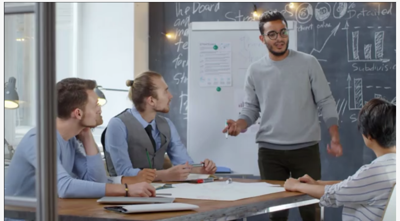
Dallas group health insurance