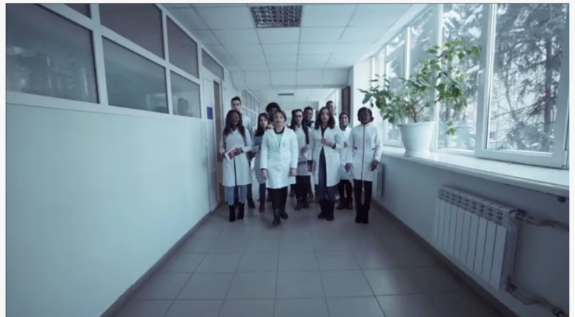
Small business health insurance Dallas